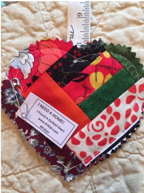
“I Found a Quilted Heart”

website was created for people to report the hearts they’ve found: https://www.ifoundaquiltedheart.com . Over 23,000 hearts have been found all around the world. There’s also a Facebook page for posting photos of found hearts.