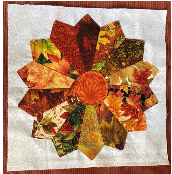
12½ inch unfinished Dresden Plate quilt block using template below.